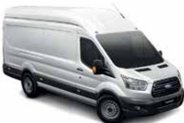
Transit 470E RWD Jumbo Van