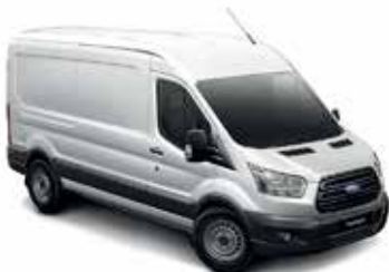
Transit 350L LWB RWD Van