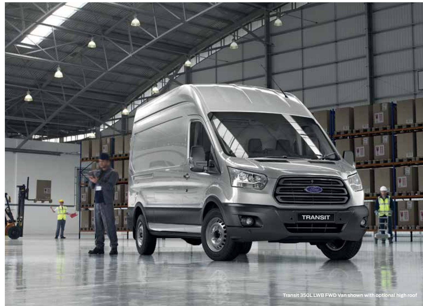
Transit 350L LWB FWD Van shown with optional high roof