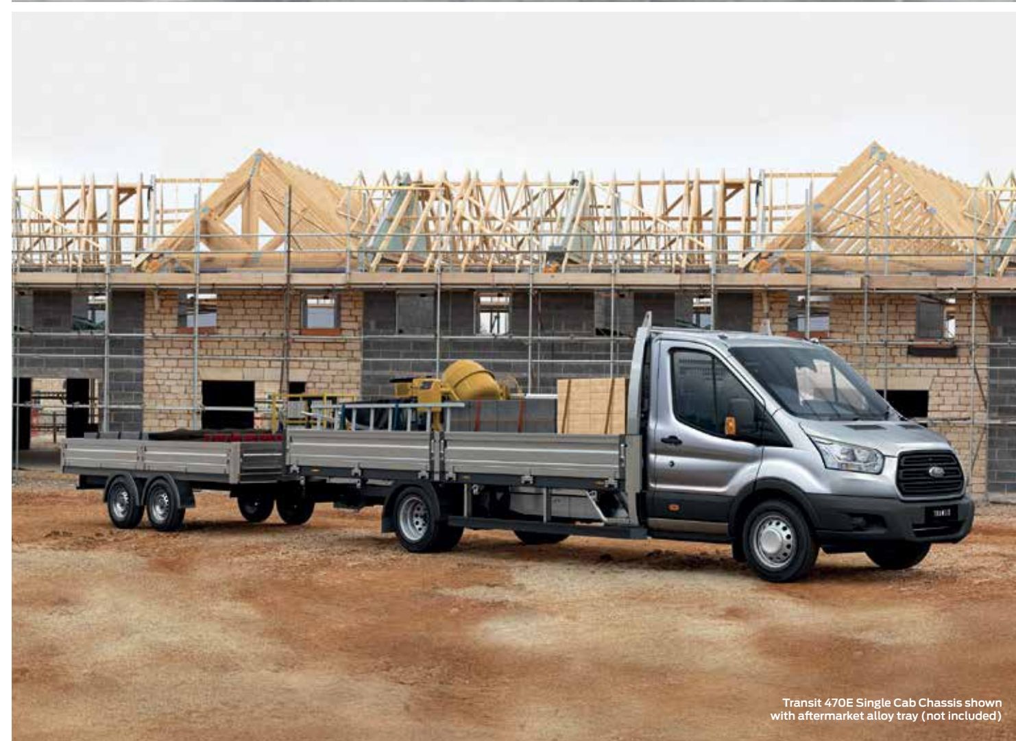
Transit 470E Single Cab Chassis shown with aftermarket alloy tray (not included)