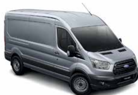
Moondust Silver 1