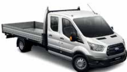
Transit 470E RWD Double Cab Chassis