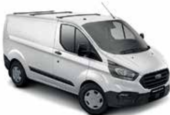
Transit Custom 300S SWB Van