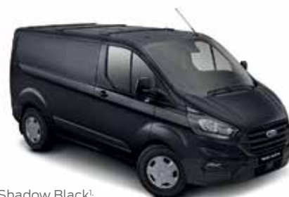
Shadow Black 1