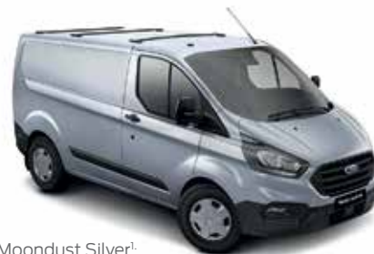
Moondust Silver 1