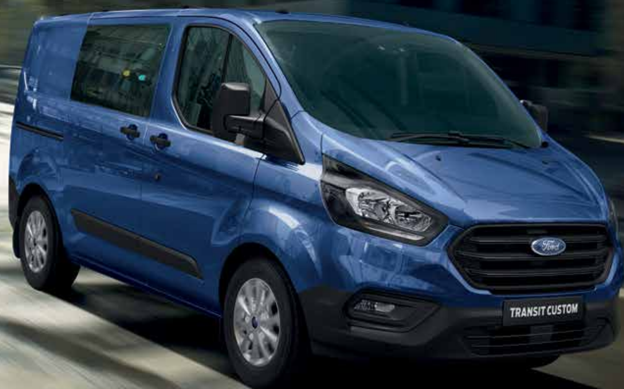
Transit Custom 300S shown with optional Tech Pack, Dual Side Load Doors with Windows and 16" alloy wheels

Welcome to the award-winning Ford Transit Commercial Vehicles Range. Renowned for their capability, dependability, safety, efficiency and car-like drive and comfort, the comprehensive Transit line-up is built to get the job done. The smart and agile Transit Custom is perfect for small business owners, while the larger Transit Van boasts an extensive cargo area built to carry big loads. These vans are available in a range of wheelbases, roof heights and drivetrain configurations, while the Transit Cab Chassis comes in both single and double cab body styles that can be customised to suit your needs.