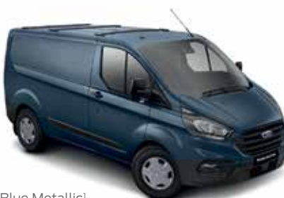
Blue Metallic 1