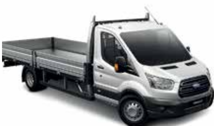
Transit 470E RWD Single Cab Chassis