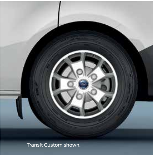
Transit Custom shown.

Stylish alloy wheels to complement your Transit Commercial Vehicle's modern design.