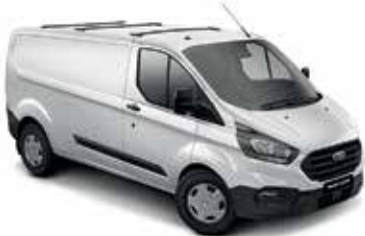
Transit Custom 340L LWB Van