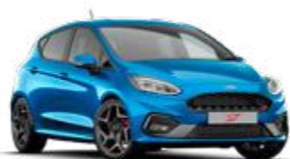
Ford Performance Blue*