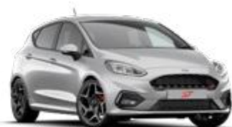
Moon dust Silver*