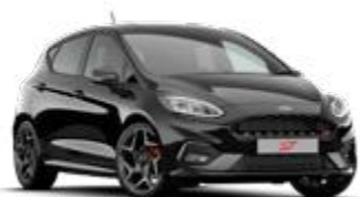
Agate Black Metallic*